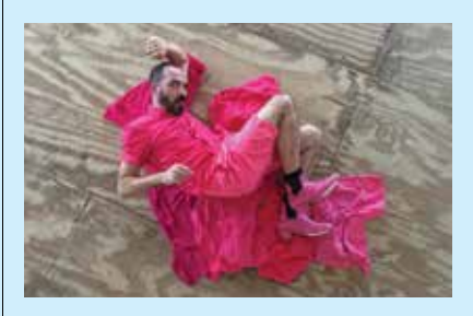
5/24-6/24 Out in the Tropics Festival FundArte.us