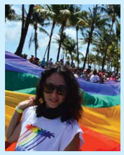
4/1-7 Miami Beach Pride MiamiBeachPride.com

Through 5/15 Dade Heritage Days DadeHeritageTrust.org